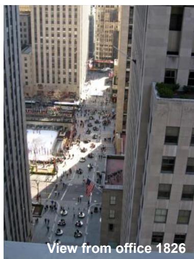
View from office 1826