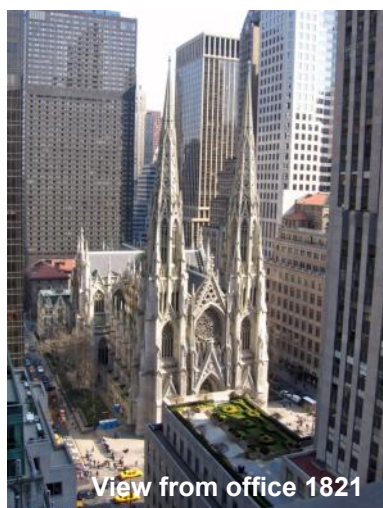
View from office 1821

Your company can be up and running in a new office with telephone, Internet access and conference room in less than a day.